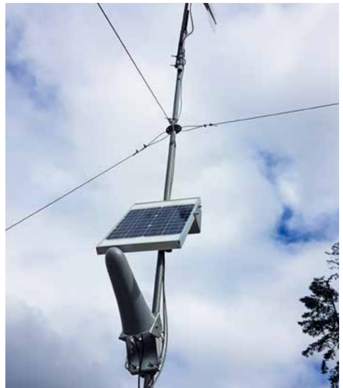
Weather stations across our forest lands collect and transmit real-time fire weather data that guides our forest management decision making.

Mosaic’s fuel management program is another important tool in preventing wildfire. We manage fuels (potentially combustible material in the forest) in various ways, including chipping, on-site burning, and the sale of firewood cutting permits. Every year, Mosaic donates funds collected through the sale of firewood cutting permits and doubles it through a matching contribution to a deserving community organization.