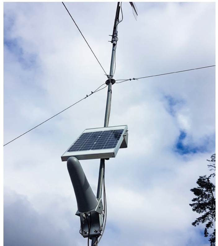
Weather stations across our forest lands collect and transmit real-time fire weather data that guides our forest management decision making.

Mosaic’s fuel management program is another important tool in preventing wildfire. We manage fuels (potentially combustible material in the forest) in various ways, including chipping, on-site burning, and the sale of firewood cutting permits. Every year, Mosaic donates funds collected through the sale of firewood cutting permits and doubles it through a matching contribution to a deserving community organization.