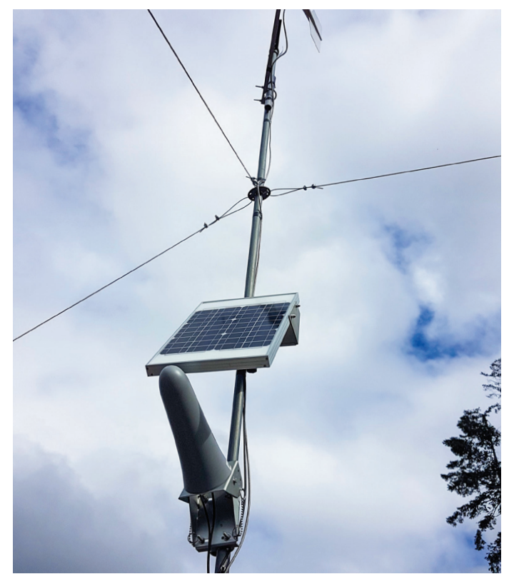
Weather stations across our forest lands collect and transmit real-time fire weather data that guides our forest management decision making.

Mosaic's fuel management program is another important tool in preventing wildfire. We manage fuels (potentially combustible material in the forest) in various ways, including chipping, on-site burning, and the sale of firewood cutting permits. Every year, Mosaic donates funds collected through the sale of firewood cutting permits and doubles it through a matching contribution to a deserving community organization.